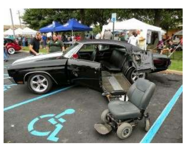
In the USA