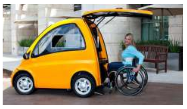
In the USA